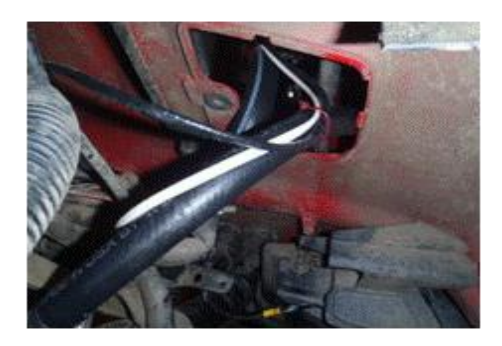
Bottom view - Looking Up

Now it is time to attach the new radiator hoses your kit came with. You can run the hoses however you want but the little "hood" your quad had the hoses fit perfectly through. This makes for an easier install, as well as less modifying to your quads plastic.