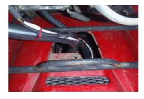
Top view - Looking Down