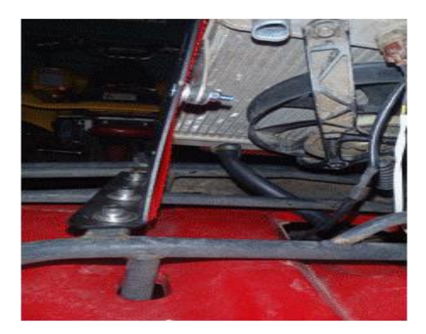
Now that you have assembled and mounted your radiator to your quad, you can start to reattach your newly lengthened wires back to your radiator. Be sure not to mix up the wires and plug them in to the wrong spots.

Now it is time to attach the new radiator hoses your kit came with. You can run the hoses however you want but the little "hood" your quad had the hoses fit perfectly through. This makes for an easier install, as well as less modifying to your quads plastic.